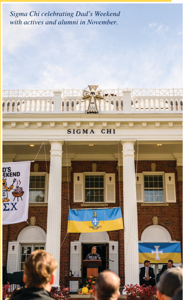
Sigma Chi celebrating Dad's Weekend with actives and alumni in November.