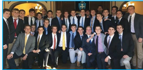
New members celebrate their initiation.