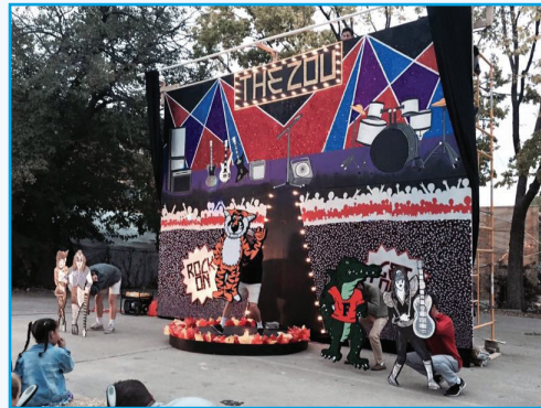
New members perform a short skit at Mizzou’s annual Homecoming house decoration celebration.